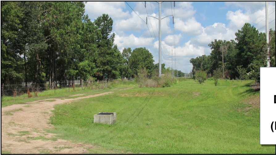
EXISTING DEAD END ON SW 47TH AVE (Looking North)