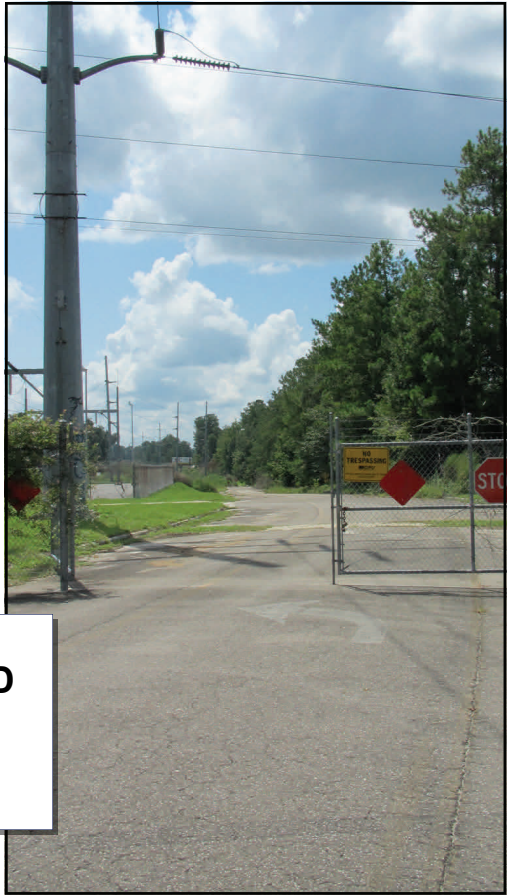
EXISTING DEAD END ON SW 40TH BLVD (Looking South)