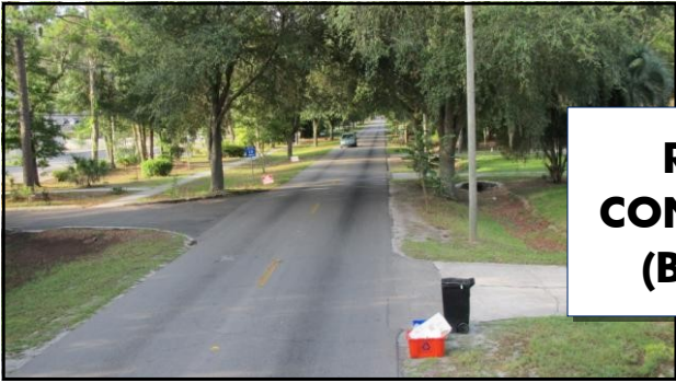
ROAD CONDITION (Before)