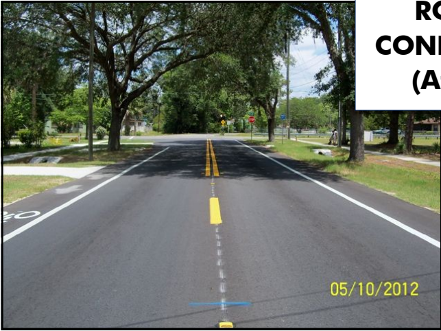
ROAD CONDITION (After)