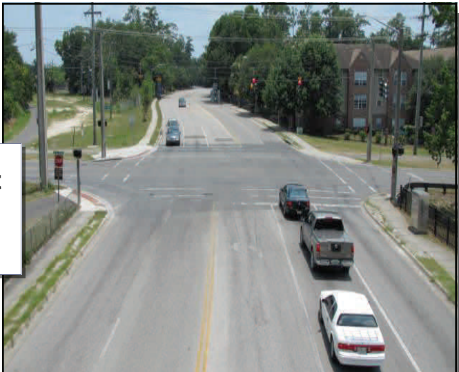
Segment 2: SW 6th St at Depot Ave, looking south (Existing)