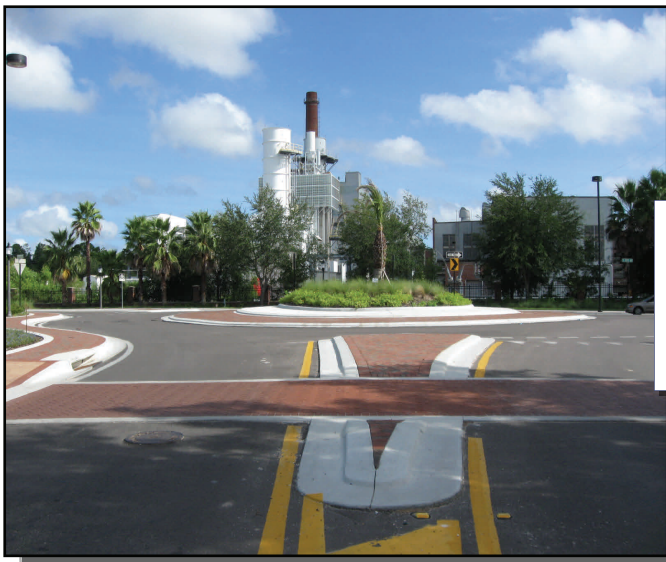
Segment 3: Roundabout at SE 4th St, looking north (Completed)